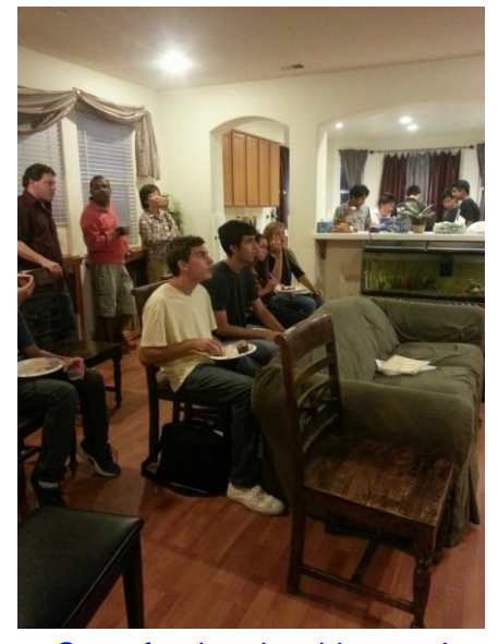
Great food and a video, too!