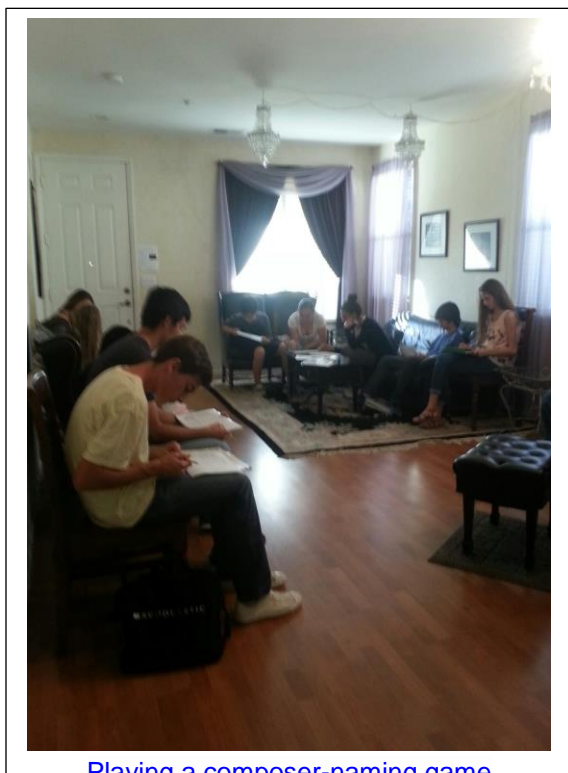
Playing a composer-naming game