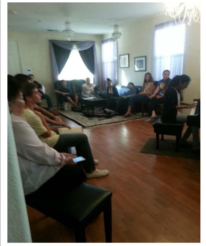
Mesmerized by the music making