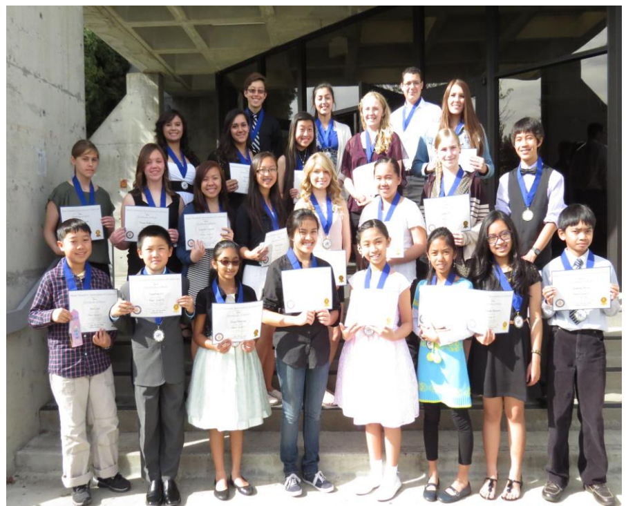
Honor Recital Performers on March 8, 2014 – First Recital