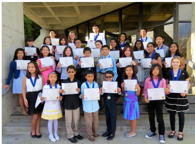
Honor Recital Performers on March 8, 2014 second recital