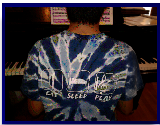
(Bristow Middle School's Band T-shirt)